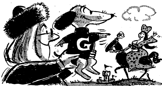
Only last week he invented the German short-haired pointer.

Persia without a "P" was of course called Ersia. This so embarrassed the natives that they changed the name of the country to Iran. This led to a rash of name changing. Mesopotamia became Iraq, Schleswig-Holstein became Saxe-Coburg, Bosnia-Herzegovina became Cleveland. There was even talk about changing the name of stable old England, but it was forgotten when the little princes escaped from the Tower and invented James Watt. This later became known as the Missouri Compromise.