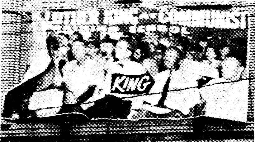
This poster reading "Martin Luther at Communist Training School" was hanging from the American Bible Society building several blocks from the Capitol building in Montgomery.

Selma is "progressive & friendly" and involved in a struggle for human dignity which has changed this tranquil Southern town from a dot in the topology of central Alabama to a focal point for the civil rights movement. Sylvan Street is the center of the Negro community of Selma. On one end of its unpaved roadways and sidewalks is Brown's Chapel and on the other is the First Baptist Church. Between these lie the George Washington lower Houses, a Federally constructed, low income, segregated, housing development. The phones in the SCLC office in Brown's Chapel are bugged by the State Police and the mail has not been collected from Sylvan Street's red, white and blue boxes for eight weeks now (too many Northern agitators and priests were sending picture post cards to their friends back home). There were several Army jeeps parked on the street across