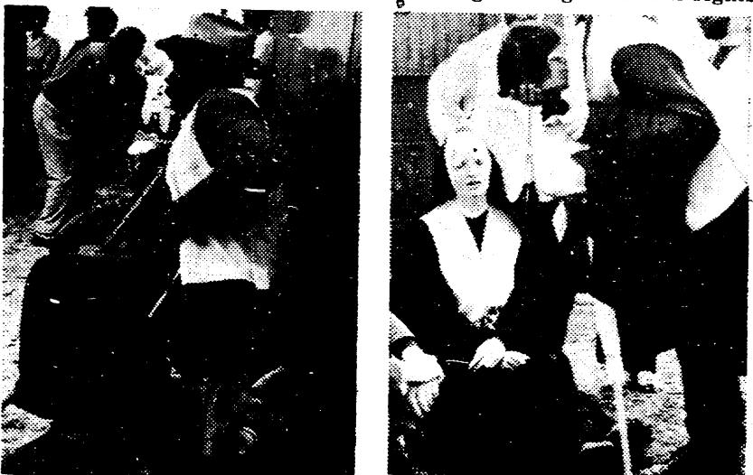
The marchers pictured above are resting while awaiting the last leg of the march from Selma to Montgomery.

The Negro people of Selma welcomed us into their homes and gave us places to sleep and eat. The best part of the week's experiences was living with these families and learning about their frustration with the system and their faith in the change through the civil rights